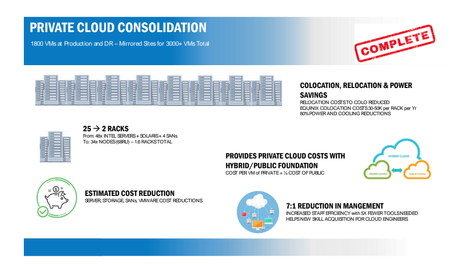
Figure 1: Results of First Major Project in 2018-19

Figure one is a summary chart we put together after the completion of our first major project with Fairfax, in 2018-2019. We then worked on other transformative projects together, when CAS was able to provide best-value solutions, to help the organization make several significant modernizations and advancements, in the Platforms, Cloud, and Security markets. We have several subsequent results achieved together, but another way to look at the impact CAS has made in partnership with Fairfax, and our ability to honor and deliver on a contract of this type, is through the annualized revenues.